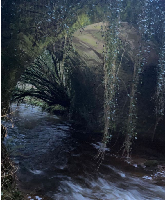
Plate 9-9: Concrete cast of bridge arch.