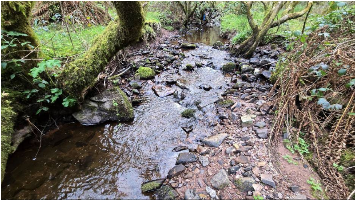
Plate 9-6: Sample site for watercourse crossing location at the Field Chimney Stream (Triturus Environmental Ltd, 2025)

This watercourse crossing was located on the upper reaches of the Field Chimney Stream, a tributary of the Inchinanagh River. The sinuous upland channel (FW1) was of very high energy, flowing over a moderate gradient with exposed sandstone boulder cascades. The stream was 2-3m wide and 0.1-0.3m deep with steep banks that graded into the adjoining V-shaped valley. The stream had a profile of shallow cascading riffle and glide with localised plunge pools. The bed comprised of rounded boulder, cobble, mixed gravels and sand. The substrata had light to moderate siltation with the substrata being moderately bedded. The site did not support macrophytes given high energies and shading. However, instream boulders supported the liverwort Chiloscyphus polyanthos in shaded pockets with more frequent Rhynchostegium riparioides on exposed boulder tops. The riparian areas supported frequent grey willow that bordered mature Sitka spruce ( Picea sitchensis ) from the adjoining plantations (WD4).