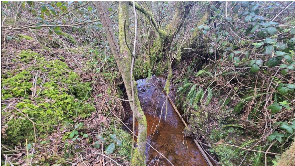
Plate 9-7: Sample site for watercourse crossing location at the Red Bog Stream (Triturus Environmental Ltd, 2025)

This site was located on the Red Bog Stream (18R48). The small Coom River tributary had been historically deepened and straightened through coniferous afforestation (WD4) and improved pasture (GA1). The small upland stream (FW1) was 0.5-1m wide and <0.2m deep with 1.5m bank heights. The profile comprised very shallow riffle and glide. The channel evidently suffered from low dry weather flows. The substrata were dominated by boulder and cobble with heavily mixed gravels. These were heavily silted and bedded with high cover of flocculant iron-oxidising bacterial films. The site did not support macrophytes due to heavy shading. The riparian zones supported frequent grey willow, gorse and bramble scrub (WS1). The site was bordered by improved pasture (GA1) and mature scrub buffers with coniferous afforestation upstream (WD4).