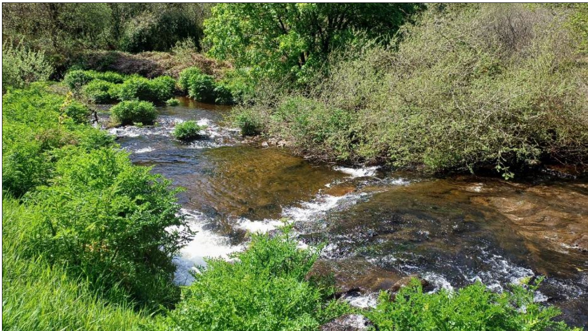
Plate 9-2: Sample site for watercourse crossing location at the River Bride Bridge (Triturus Environmental Ltd, 2025)

This watercourse crossing location is on the River Bride at Bride Bridge, upstream of its confluence with the Coom River. The natural upland watercourse (FW1) flowed over exposed bedrock resulting in deep pools between bedrock cascades. The river was 6-10m wide and 0.1-0.6m deep with gently sloping, well-vegetated banks. The substrata were dominated by bedrock with frequent cobble and mixed gravels. Boulders were scattered. Filamentous algae cover was high (c.70% of the bed), indicative of enrichment pressures. However, siltation was low given the high energy nature of the channel. Given high flow rates, macrophytes were scarce with only localised water crowfoot ( Ranunculus sp. ) and hemlock water dropwort. Instream boulders also supported occasional bryophytes including Rhynchostegium riparioides and Fontinalis squamosa . The wet riparian areas were dominated by willow ( Salix spp. ) and hawthorn with occasional iris ( Iris pseudacorus ). The site was bordered by improved pasture (GA1) and coniferous afforestation (WD4) with mature scrubby buffers.