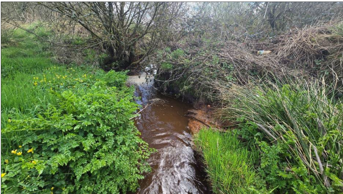
Plate 9-3: Sample site for watercourse crossing location at the Toor River (downstream) (Triturus Environmental Ltd, 2025)

The watercourse crossing located on the upper reaches of the Toor River was small upland river channel (FW1) and had been historically deepened but retained good sinuosity with a profile of deep glide and riffle and localised shallow pool on meanders. The river was 1.5-2m wide and 0.1-0.5m deep with 1m high banks. The bed comprised boulder, cobble and mixed gravels but these were heavily silted with the substrata being moderately bedded. This was mainly due to unfenced cattle access to the small river upstream (poaching) where significant volumes of eroded silt were entering the river. Water-crowfoot ( Ranunculus sp. ) was occasional instream. Larger instream boulders supported locally frequent Fontinalis antipyretica . The channel margins supported occasional marsh marigold ( Caltha palustris ) and hemlock water-dropwort ( Oenanthe crocata ). The riparian areas featured frequent scattered grey willow, gorse and bramble. Wet hollows in the adjoining willows supported tussock sedge ( Carex paniculata ), soft rush ( Juncus effusus ), hemlock water dropwort, marsh marigold and hairy bittercress ( Cardamine hirsuta ). The site was bordered by improved pasture (GA1) and coniferous afforestation (WD4).