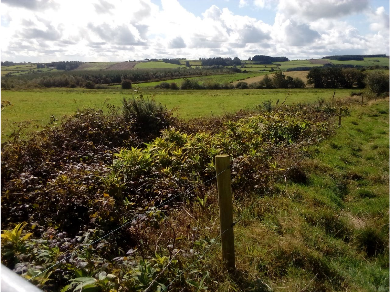
Plate 9-8: Himalayan knotweed infestation at drainage ditch crossing along 33 kV at Watercourse Crossing 49

Cherry Laurel ( Prunus laurocerasus ), Montbretia ( Crococsmia × crocosmiiflora ), Fuchsia ( Fuchsia magellanica ) and Old Man's Beard ( Clematis vitalba ) were also recorded within the construction footprint. While these species are considered invasive in Ireland, they are not listed as Third Schedule invasive species.