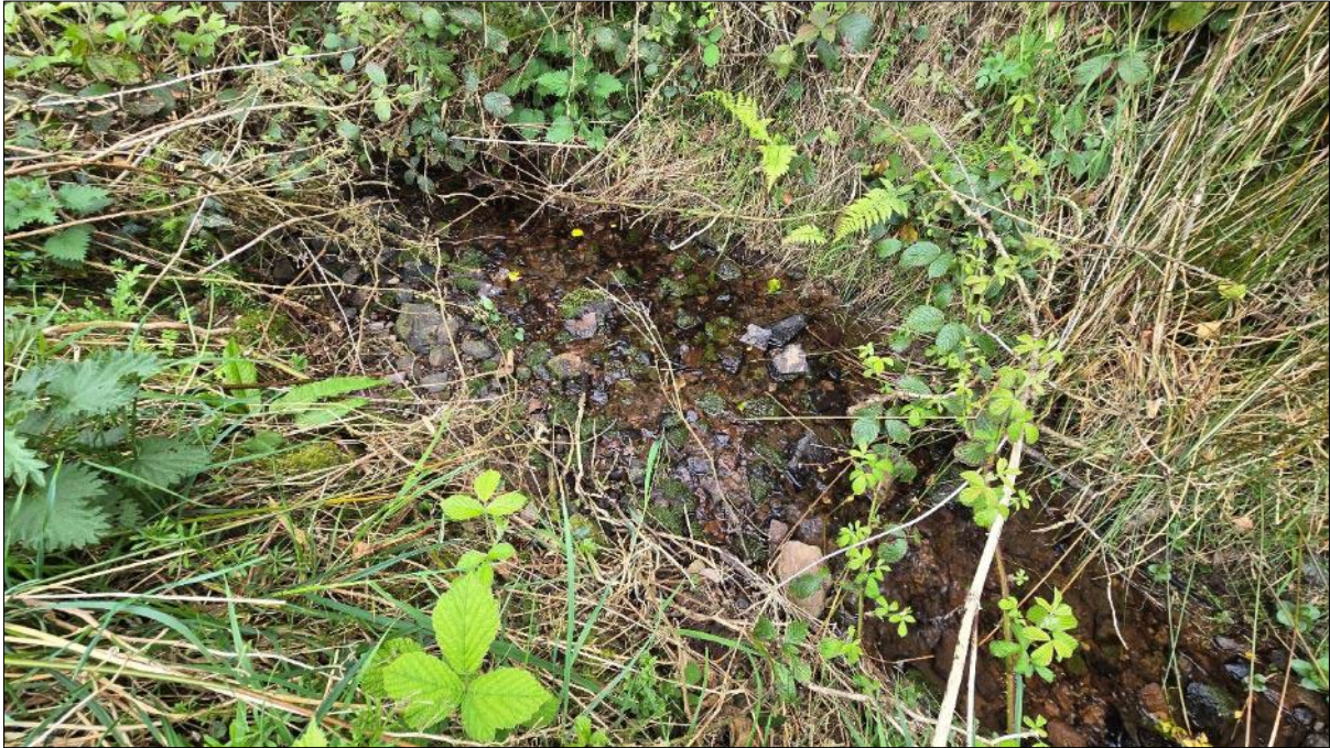
Plate 9-1: Sample site for watercourse crossing location Shanowen Trib 1 Stream (Triturus Environmental Ltd, 2025)

This watercourse was a small lowland depositing stream (FW2) and had been historically straightened and locally straightened resulting in a homogenous channel 1m wide with 1m high banks. The stream suffered from low flows at the time of survey and was 0.05m deep with a profile of very shallow slow-flowing riffle. The bed comprised heavily bedded and silted small boulder, cobbles and gravels with some low rates of siltation. The site supported occasional water mint ( Mentha aquatica ) with the liverwort ( Riccardia chamedryfolia ) present on instream cobble. The riparian areas featured mature hawthorn ( Crataegus monogyna ), gorse ( Ulex europaeus ) and bramble ( Rubus fruticosus agg.) adjoining improved pasture (GA1).