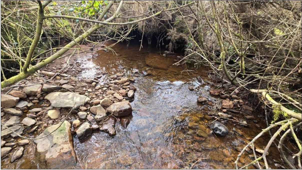
Plate 9-5: Sample site for watercourse crossing location at Bunnaglanna Stream (Triturus Environmental Ltd, 2025)