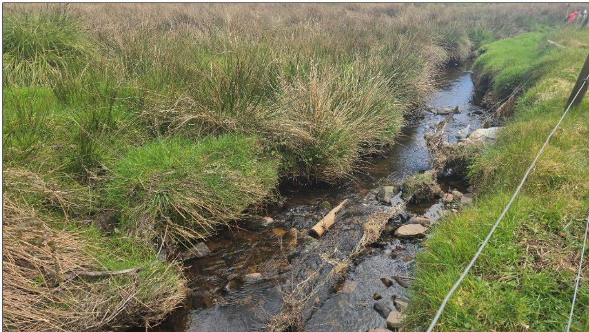
Plate 9-4: Sample site for watercourse crossing location at the Toor River (upstream) (Triturus Environmental Ltd, 2025)

This watercourse crossing crosses the Toor river upstream of watercourse crossing 52. It is to be built as part of the previously consented CGEP. The small upland channel (FW1) had been historically straightened through a coniferous plantation (WD4) and improved pasture (GA1). The river was 1.5-2m wide and 0.1-0.4m deep with 1m bank heights. The profile was of deep glide and riffle with very localised pool. The bed comprised boulders, cobble, mixed gravels and sand. These were moderately silted with substrata being moderately bedded. Bank erosion, inclusive of livestock poaching, was widespread. The small river supported no macrophytes due to its high energy. However, instream sandstone boulders supported the moss species Rhynchostegium riparioides . The riparian areas were predominantly open pasture with pockets of species-poor wet grassland (GS4) and or bordered by semi-mature sitka spruce ( Picea sitchensis ) woodland (WD4).